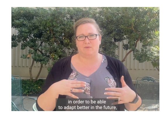
Check out our video testimonials of real transformation!!